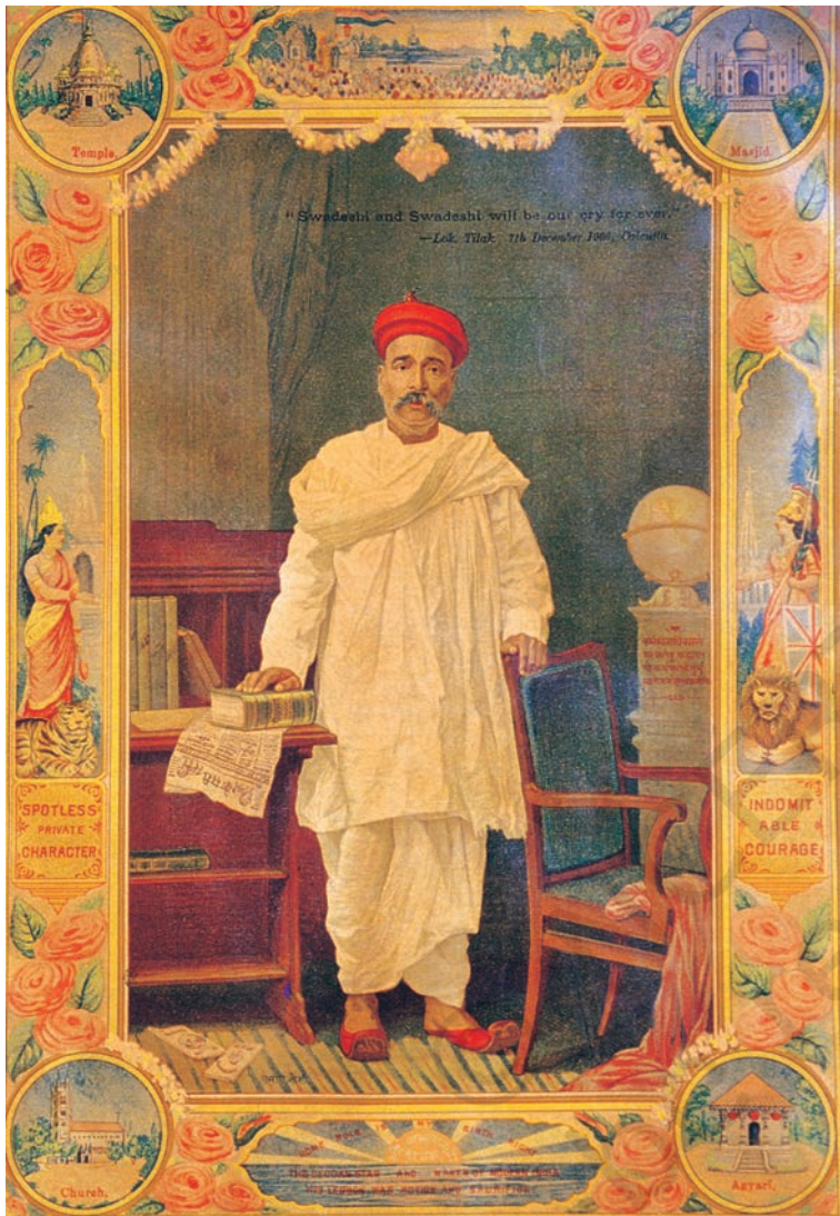
Fig. 11 – Bal Gangadhar Tilak, an early-twentieth-century print. Notice how Tilak is surrounded by symbols of unity. The sacred institutions of different faiths (temple, church, masjid) frame the central figure.

Nationalism spreads when people begin to believe that they are all part of the same nation, when they discover some unity that binds them together. But how did the nation become a reality in the minds of people? How did people belonging to different communities, regions or language groups develop a sense of collective belonging?