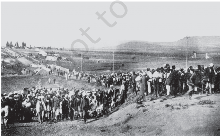
Fig. 2 – Indian workers in South Africa march through Volksrust, 6 November 1913.

Mahatma Gandhi was leading the workers from Newcastle to Transvaal. When the marchers were stopped and Gandhiji arrested, thousands of more workers joined the satyagraha against racist laws that denied rights to non-whites.