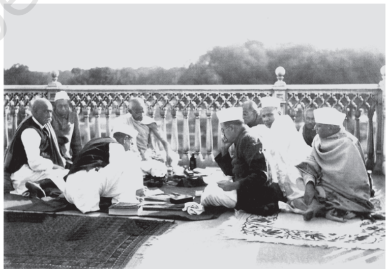
Fig. 6 – Meeting of Congress leaders at Allahabad, 1931. Apart from Mahatma Gandhi, you can see Sardar Vallabhbhai Patel (extreme left), Jawaharlal Nehru (extreme right) and Subhas Chandra Bose (fifth from right).