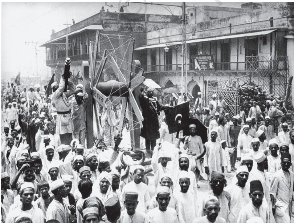
Fig. 4 – The boycott of foreign cloth, July 1922. Foreign cloth was seen as the symbol of Western economic and cultural domination.

Boycott – The refusal to deal and associate with people, or participate in activities, or buy and use things; usually a form of protest