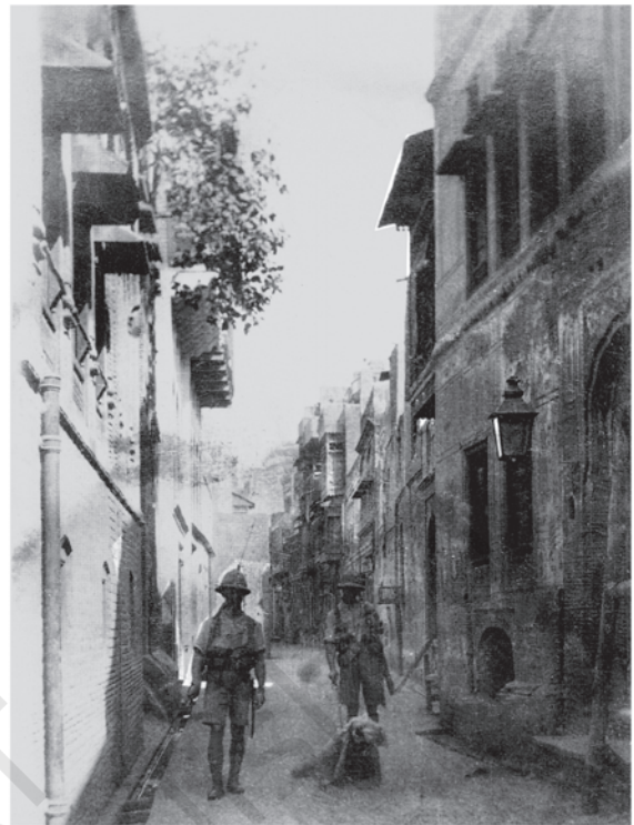
Fig. 3 – General Dyer's 'crawling orders' being administered by British soldiers, Amritsar, Punjab, 1919.

In his famous book Hind Swaraj (1909) Mahatma Gandhi declared that British rule was established in India with the cooperation of