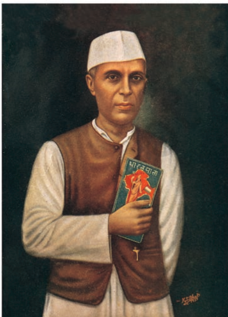
Fig. 13 – Jawaharlal Nehru, a popular print.

Notice that the mother figure here is shown as dispensing learning, food and clothing. The mala in one hand emphasises her ascetic quality. Abanindranath Tagore, like Ravi Varma before him, tried to develop a style of painting that could be seen as truly Indian.