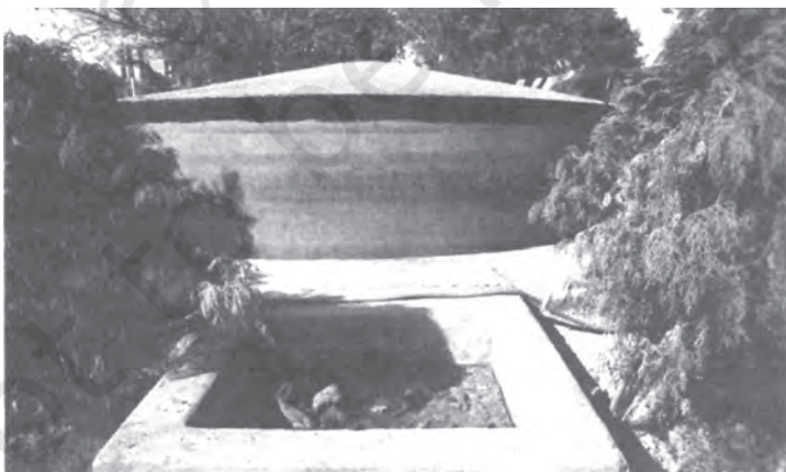
Fig.7.4 Gobar Gas Plant uses cattle dung to produce energy

Wind Power: In areas where speed of wind is usually high, wind mills can provide electricity without any adverse impact on the environment. Wind turbines move with the wind and electricity is generated. No doubt, the initial cost is high. But the benefits are such that the high cost gets easily absorbed.