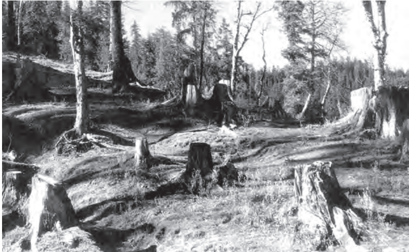
Fig. 7.3 Deforestation leads to land degradation, biodiversity loss and air pollution

India has abundant natural resources in terms of rich quality of soil , hundreds of rivers and tributaries, lush green forests , plenty of mineral deposits beneath the land surface, vast stretch of the Indian Ocean , ranges of mountains , etc. The black soil of the Deccan Plateau is particularly suitable for cultivation of cotton, leading to concentration of textile industries in this region. The Indo-Gangetic plains — spread from the Arabian Sea to the Bay of Bengal — are one of the most fertile, intensively cultivated and densely populated regions in the world. India's forests , though unevenly distributed, provide green cover for a majority of its population and natural cover for its wildlife. Large deposits of iron-ore , coal and natural gas are found in the country. India accounts for nearly 8 per cent of the world's total iron-ore reserves. Bauxite , copper , chromate , diamonds , gold , lead , lignite , manganese , zinc , uranium , etc. are also available in different parts of the country. However, the developmental activities in India have resulted in