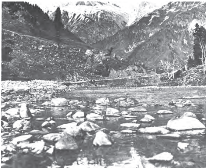
Fig. 7.1 Water bodies: small, snow-fed Himalayan streams are the few fresh-water sources that remain unpolluted.

this results in an environmental crisis. This is the situation today all over the world. The rising population of the developing countries and the affluent consumption and production standards of the developed world have placed a huge stress on the environment in terms of its first two functions. Many resources have become extinct and the wastes generated are beyond the absorptive capacity of the environment. Absorptive capacity means the ability