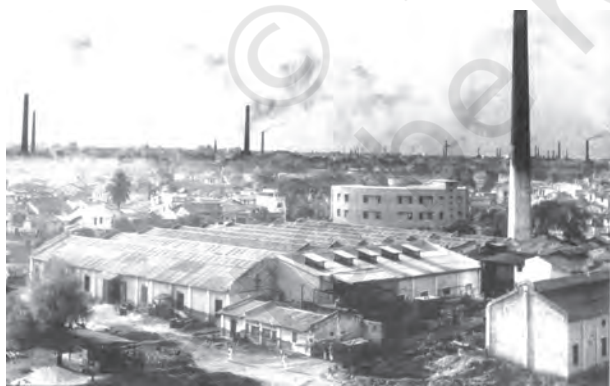
Fig. 7.2 Damodar Valley is one of India's most industrialised regions. Pollutants from the heavy industries along the banks of the Damodar river are converting it into an ecological disaster

But with population explosion and with the advent of industrial revolution to meet the growing needs of the expanding population, things changed. The result was that the demand for resources for both production and consumption went beyond the rate of regeneration of the resources; the pressure on the absorptive capacity of the environment increased tremendously — this trend continues even today. Thus what has happened is a reversal of supply-demand relationship for environmental quality — we are now faced with increased demand for environmental resources and services but their supply is limited due to overuse