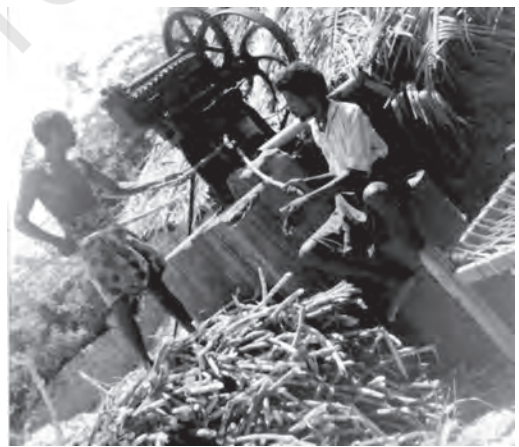
Fig. 5.2 Jaggery making is an allied activity of the farming sector

greater risk in depending exclusively on farming for livelihood. Diversification towards new areas is necessary not only to reduce the risk from agriculture sector but also to provide productive sustainable livelihood options to rural people. Much of the agricultural employment activities are concentrated in the Kharif season. But during the Rabi season, in areas where there are inadequate irrigation facilities, it becomes difficult to find gainful employment. Therefore expansion into other sectors is essential to provide supplementary gainful employment and in realising higher levels of income for rural people to overcome poverty and other tribulations. Hence, there is a need to focus on allied activities, non-farm employment and other emerging alternatives of livelihood, though there are many other options available for providing sustainable livelihoods in rural areas.