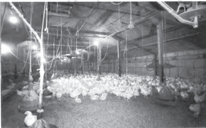
Fig. 5.4 Poultry has the largest share of total livestock in India

However problems related to over- fishing and pollution need to be regulated