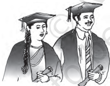
Fig. 4.7 Higher Education: few takers

The differences in literacy rates between males and females are narrowing signifying a positive development in gender equity; still the need to promote education for women in India is imminent for various reasons such as improving economic independence and social status of women and also because women education makes a favourable impact on fertility rate and health care of women and children. Therefore, we cannot be complacent about the upward movement in the literacy rates and we have miles to go in achieving cent per cent adult literacy.