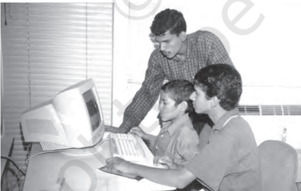
Fig. 4.4 Job on hand: transforming India into a knowledge economy

workforce, particularly involving mathematics, computer science, and data science, in conjunction with multidisciplinary abilities across the sciences and social sciences, and humanities, will be increasingly in greater demand. With climate change, increasing pollution, and depleting natural resources, there will be a sizeable shift in how we meet the world's energy, water, food, and sanitation needs, again resulting in the need for new skilled labour, particularly in biology, chemistry, physics, agriculture, climate science, and social science. The growing emergence of epidemics and pandemics will also call for collaborative research in infectious disease management and development of vaccines and the resultant social issues heightens the need for multidisciplinary learning. There will be a growing demand for humanities and art, as India moves towards becoming a developed country as well as