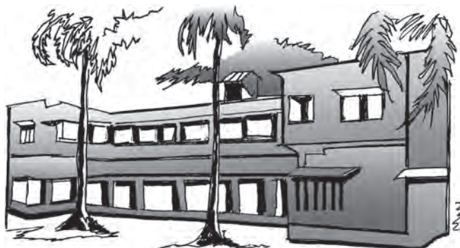
Fig. 4.5 Investment in educational infrastructure is inevitable

One can understand the inadequacy of the expenditure on education if we compare it with the desired level of education expenditure as recommended by the various commissions. The Education Commission (1964–66) had recommended that at least 6 per cent of GDP be spent on education so as to make a noticeable rate of growth in educational achievements. The Tapas Majumdar Committee , appointed by the Government of India in 1999, estimated an expenditure of around Rs 1.37 lakh crore over 10 years (1998-