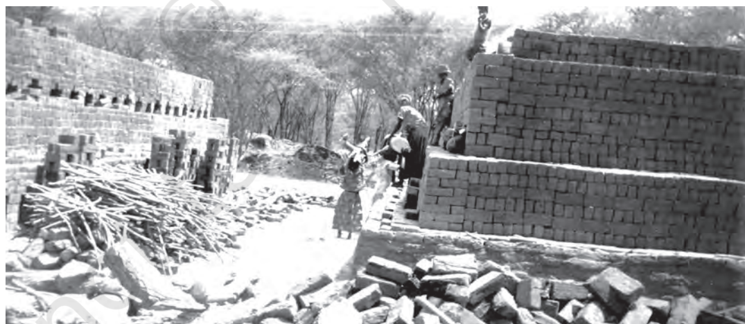
Fig. 4.6 School dropouts give way to child labour: a loss to human capital

Education for All — Still a Distant Dream: Though literacy rates for both — adults as well as youth — have increased, still the absolute number of illiterates in India is as much as India's population was at the time of independence. In 1950, when the Constitution of India was passed by the Constituent Assembly, it was noted in the Directive Principles of the