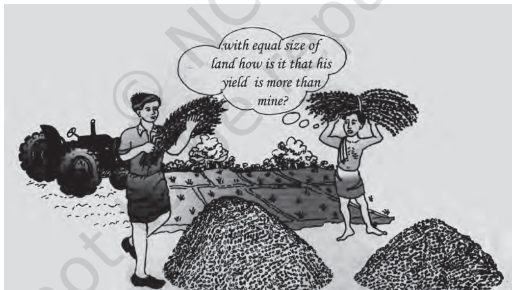
Fig. 4.1 Adequate education and training to farmers can raise productivity in farms

Education is sought not only as it confers higher earning capacity on people but also for its other highly valued benefits: it gives one a better social standing and pride ; it enables one to make better choices in life ; it provides knowledge to understand the changes taking place in society ; it also stimulates innovations . Moreover, the availability of educated labour force facilitates adaptation of new