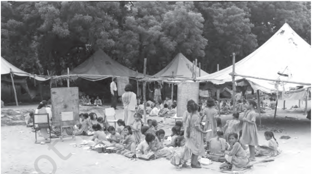
Fig. 4.2 Creating human capital: a school being run in make shift premises in Delhi

uninterrupted labour supply for a longer period of time, then health is also an important factor for economic growth. Thus, both education and health, along with many other factors like on-the-job training, job market information and migration, increase an