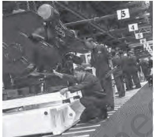
Fig. 4.3 Scientific and technical manpower: a rich ingredient of human capital

Empirical evidence to prove that increase in human capital causes economic growth is rather nebulous. This may be because of measurement problems. For example, education measured in terms of years of schooling, teacher-pupil ratio and enrolment rates may not reflect the quality of education; health services measured in monetary terms, life expectancy and mortality rates may not reflect the true health status of the people in a country. Using the indicators mentioned above, an analysis of improvement in education and health sectors and growth in real per capita income in both developing and developed countries shows that there is convergence in the measures of human capital but no sign of convergence of per capita real income . In other words, the human capital growth in developing countries has been faster but the growth of per capita real income has not been that fast . There are reasons to believe that the