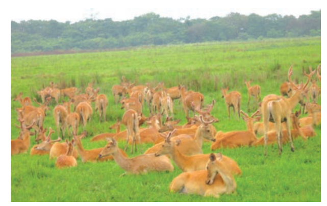
Fig. 2.2: Rhino and deer in Kaziranga National Park

equal importance as a means of preserving biotypes of sizeable magnitude. Corbett National Park in Uttarakhand, Sunderbans National Park in West Bengal, Bandhavgarh National Park in Madhya Pradesh, Sariska Wildlife Sanctuary in Rajasthan, Manas Tiger Reserve in Assam and Periyar Tiger Reserve in Kerala are some of the tiger reserves of India.