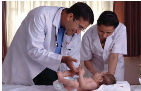
Most babies do not get basic healthcare

The problem does not end with Infant Mortality Rate. The last column of table 1.4 shows that about half of the children aged 14-15 in Bihar are not attending school beyond Class 8. This means that if you went to school in Bihar nearly half of your elementary class friends would be missing. Those who could have been in school are not there! If this had happened to you, you would not be able to read what you are reading now.