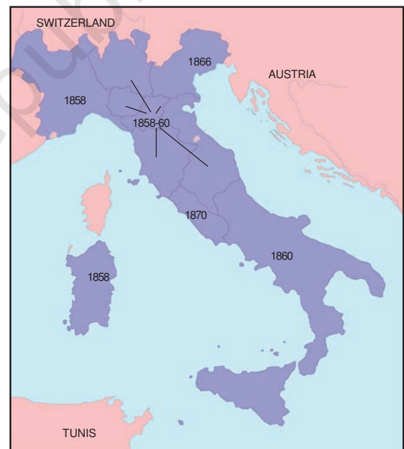
Fig. 14(b) – Italy after unification. The map shows the year in which different regions (seen in Fig 14(a)) become part of a unified Italy.