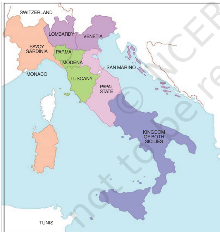
Fig. 14(a) – Italian states before unification, 1858.

Look at Fig. 14(a). Do you think that the people living in any of these regions thought of themselves as Italians? Examine Fig. 14(b). Which was the first region to become a part of unified Italy? Which was the last region to join? In which year did the largest number of states join?