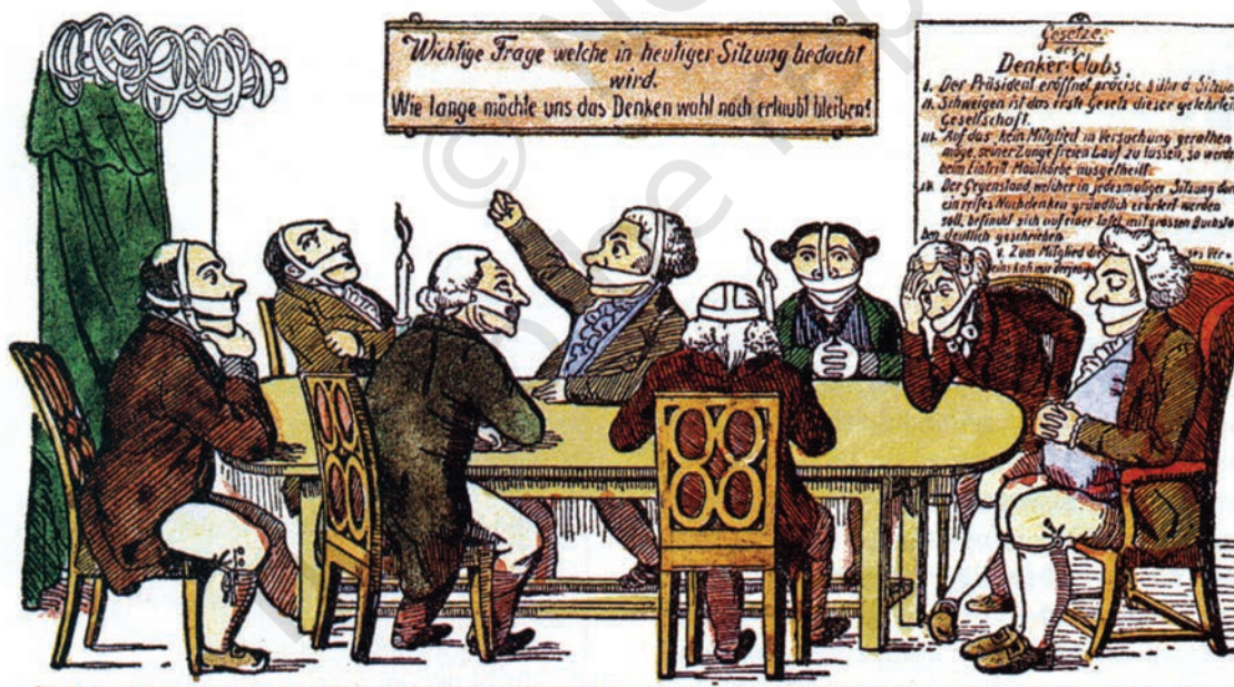
Fig. 6 – The Club of Thinkers, anonymous caricature dating to c. 1820. The plaque on the left bears the inscription: ‘The most important question of today’s meeting: How long will thinking be allowed to us?’ The board on the right lists the rules of the Club which include the following: ‘1. Silence is the first commandment of this learned society. 2. To avoid the eventuality whereby a member of this club may succumb to the temptation of speech, muzzles will be distributed to members upon entering.’

What is the caricaturist trying to depict?