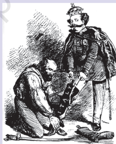
Fig. 15 – Garibaldi helping King Victor Emmanuel II of Sardinia-Piedmont to pull on the boot named ‘Italy’. English caricature of 1859.

In 1867, Garibaldi led an army of volunteers to Rome to fight the last obstacle to the unification of Italy, the Papal States where a French garrison was stationed. The Red Shirts proved to be no match for the combined French and Papal troops. It was only in 1870 when, during the war with Prussia, France withdrew its troops from Rome that the Papal States were finally joined to Italy.