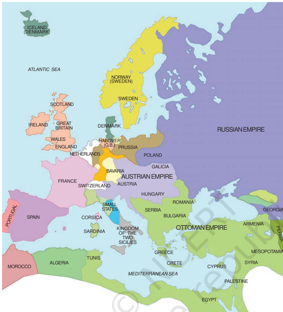
Fig. 3 – Europe after the Congress of Vienna, 1815.

Within the wide swathe of territory that came under his control, Napoleon set about introducing many of the reforms that he had already introduced in France. Through a return to monarchy Napoleon had, no doubt, destroyed democracy in France , but in the administrative field he had incorporated revolutionary principles in order to make the whole system more rational and efficient . The Civil Code of 1804 – usually known as the Napoleonic Code – did away with all privileges based on birth, established equality before the law and secured the right to property . This Code was exported to the regions under French control. In the Dutch Republic, in Switzerland, in Italy and Germany, Napoleon simplified administrative divisions, abolished the feudal system and freed peasants from serfdom and manorial dues . In the towns too, guild restrictions were removed . Transport and communication systems were improved . Peasants, artisans, workers and new businessmen