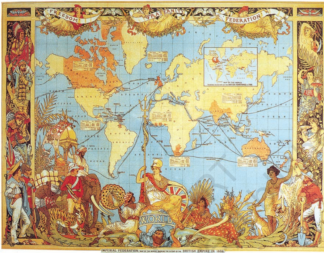
Fig. 20 – A map celebrating the British Empire.

At the top, angels are shown carrying the banner of freedom. In the foreground, Britannia – the symbol of the British nation – is triumphantly sitting over the globe. The colonies are represented through images of tigers, elephants, forests and primitive people. The domination of the world is shown as the basis of Britain's national pride.