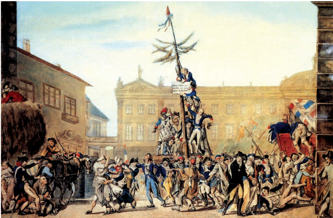
Fig. 4 – The Planting of Tree of Liberty in Zweibrücken, Germany.

The subject of this colour print by the German painter Karl Kaspar Fritz is the occupation of the town of Zweibrücken by the French armies. French soldiers, recognisable by their blue, white and red uniforms, have been portrayed as oppressors as they seize a peasant's cart (left), harass some young women (centre foreground) and force a peasant down to his knees. The plaque being affixed to the Tree of Liberty carries a German inscription which in translation reads: 'Take freedom and equality from us, the model of humanity.' This is a sarcastic reference to the claim of the French as being liberators who opposed monarchy in the territories they entered.