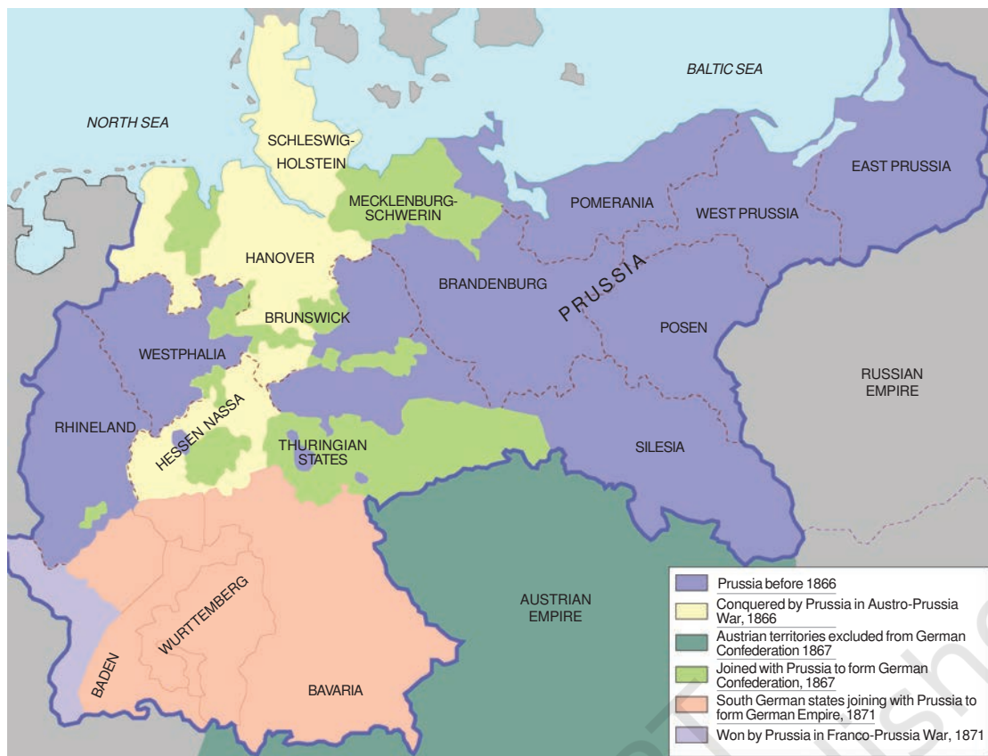
Fig. 12 – Unification of Germany (1866-71).