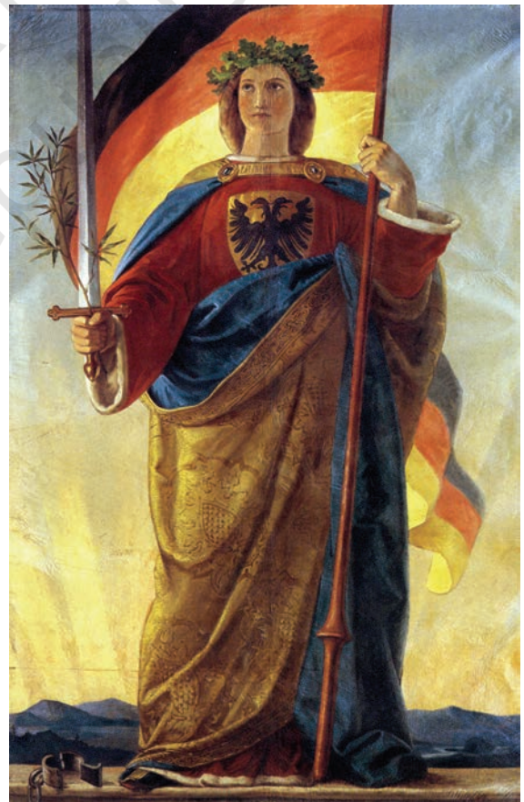
Fig. 17 – Germania, Philip Veit, 1848. The artist prepared this painting of Germania on a cotton banner, as it was meant to hang from the ceiling of the Church of St Paul where the Frankfurt parliament was convened in March 1848.