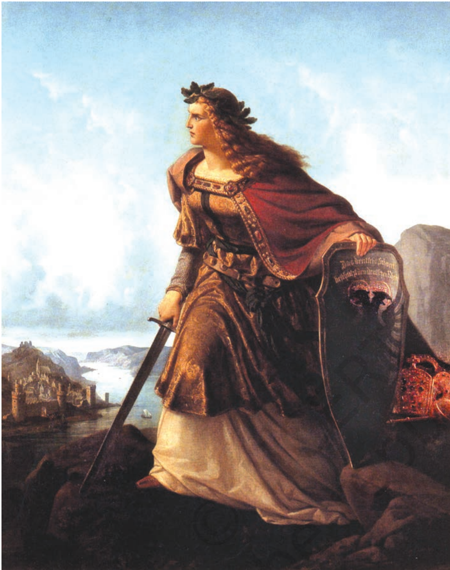
Fig. 19 — Germania guarding the Rhine.

In 1860, the artist Lorenz Clasen was commissioned to paint this image. The inscription on Germania's sword reads: 'The German sword protects the German Rhine.'