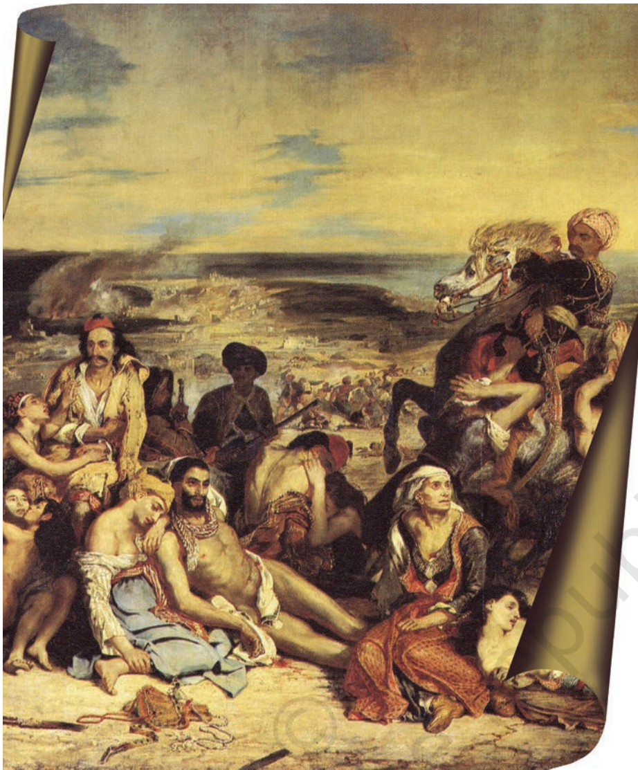
Fig. 8 – The Massacre at Chios, Eugene Delacroix, 1824.

The French painter Delacroix was one of the most important French Romantic painters. This huge painting (4.19m x 3.54m) depicts an incident in which 20,000 Greeks were said to have been killed by Turks on the island of Chios. By dramatising the incident, focusing on the suffering of women and children, and using vivid colours, Delacroix sought to appeal to the emotions of the spectators, and create sympathy for the Greeks.