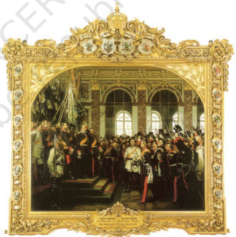
Fig. 11 – The proclamation of the German empire in the Hall of Mirrors at Versailles, Anton von Werner. At the centre stands the Kaiser and the chief commander of the Prussian army, General von Roon. Near them is Bismarck. This monumental work (2.7m x 2.7m) was completed and presented by the artist to Bismarck on the latter's 70th birthday in 1885.

The nation-building process in Germany had demonstrated the dominance of Prussian state power. The new state placed a strong emphasis on modernising the currency, banking, legal and judicial systems in Germany. Prussian measures and practices often became a model for the rest of Germany.