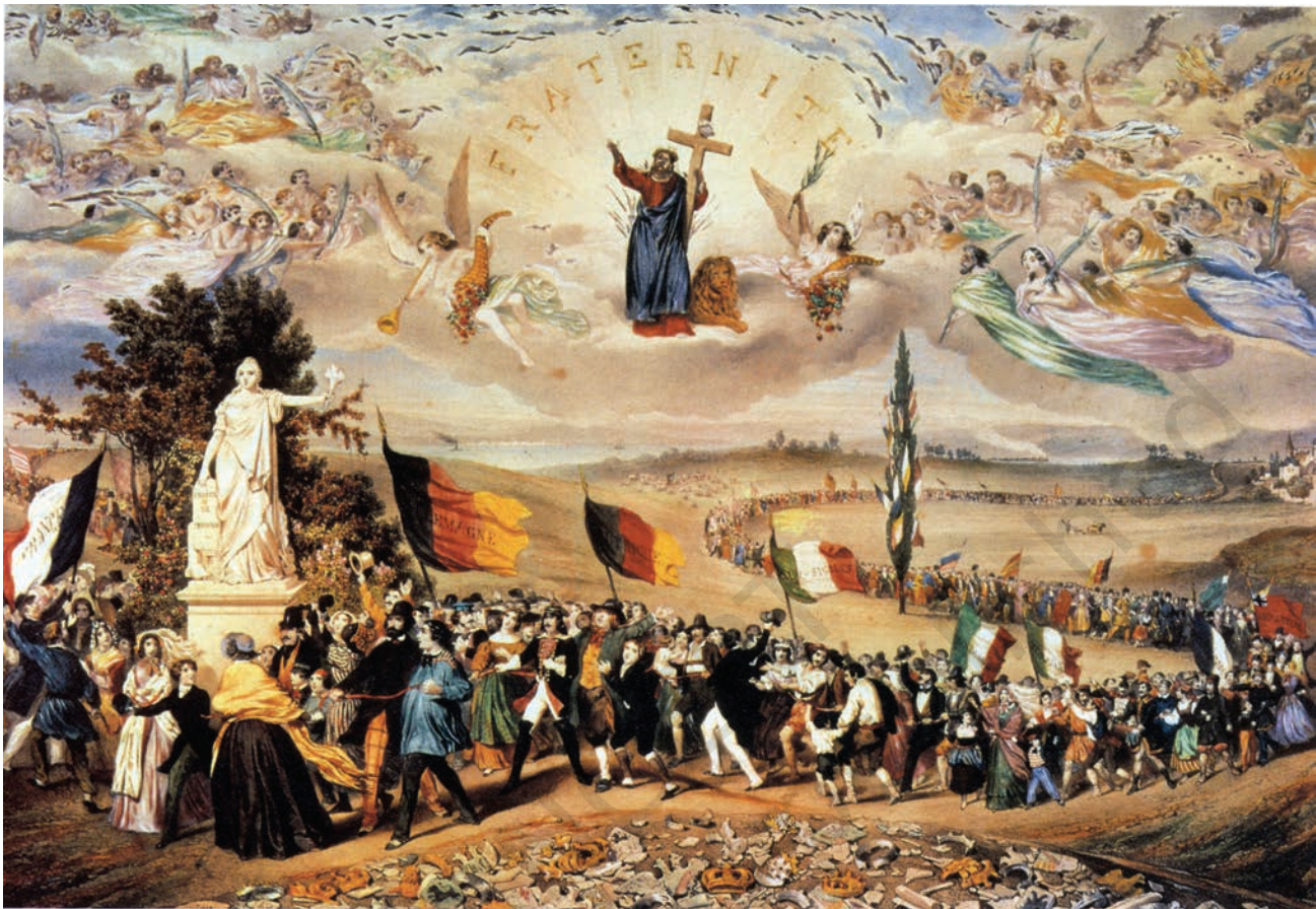
Fig. 1 – The Dream of Worldwide Democratic and Social Republics – The Pact Between Nations, a print prepared by Frédéric Sorrieu, 1848.

In 1848, Frédéric Sorrieu, a French artist, prepared a series of four prints visualising his dream of a world made up of ‘democratic and social Republics’, as he called them. The first print (Fig 1) of the series, shows the peoples of Europe and America – men and women of all ages and social classes – marching in a long train, and offering homage to the statue of Liberty as they pass by it. As you would recall, artists of the time of the French Revolution personified Liberty as a female figure – here you can recognise the torch of Enlightenment she bears in one hand and the Charter of the Rights of Man in the other. On the earth in the foreground of the image lie the shattered remains of the symbols of absolutist institutions. In Sorrieu’s utopian vision, the peoples of the world are grouped as distinct nations, identified through their flags and national costume. Leading the procession, way past the statue of Liberty, are the United States and Switzerland, which by this time were already nation-states. France,