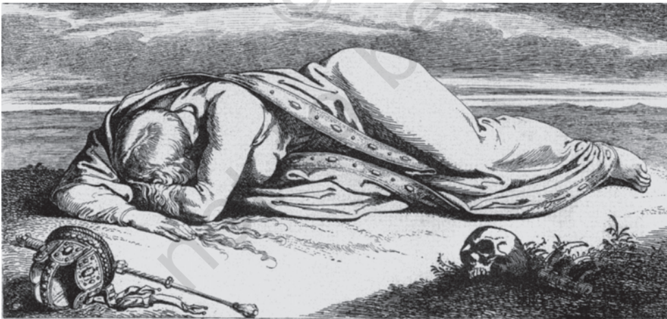
Fig. 18 – The fallen Germania, Julius Hübner, 1850.