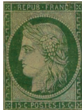
Fig. 16 – Postage stamps of 1850 with the figure of Marianne representing the Republic of France.

Allegory – When an abstract idea (for instance, greed, envy, freedom, liberty) is expressed through a person or a thing. An allegorical story has two meanings, one literal and one symbolic