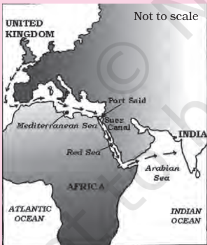
Fig.1.2 Suez Canal: Used as highway between India and Britain

Various details about the population of British India were first collected through a census in 1881. Though suffering from certain limitations, it revealed the unevenness in India's population growth. Subsequently,