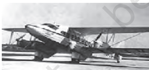
Fig.1.5 Tata Airlines, a division of Tata and Sons, was established in 1932 inaugurating the aviation sector in India

cost to the government exchequer, yet, it failed to compete with the railways , which soon traversed the region running parallel to the canal , and had to be ultimately abandoned. The introduction of the expensive system of electric telegraph in India, similarly, served the purpose of maintaining law and order . The postal services , on the other hand, despite serving a useful public purpose, remained all through inadequate .